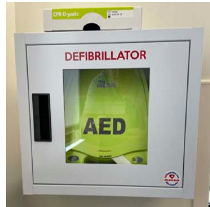
Figure 7.3.

Contact: AEDGrant.com 565 Westlake St. Building 100 Encinitas, CA 92024 760-944-1048 info@aedgrant.com