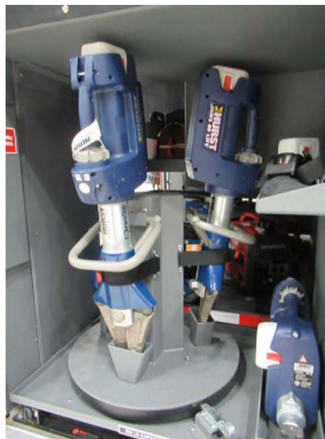
Figure 3.2.

Grant writing can be a daunting task. Don't be afraid to ask for help early on in the process. There are many ways to become educated on grant writing and grant management. Online tutorials are available, and many private agencies and academic institutions offer classes and workshops. The Foundation Directory Online (FDO) by Candid (formerly known as The Foundation Center) is a leading source of information on philanthropy, fundraising and grant programs. It offers online resources and free assistance at any of its regional offices.