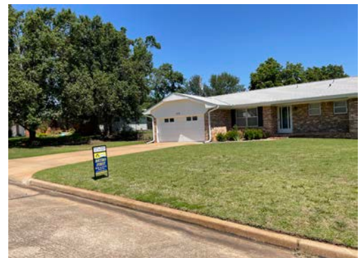
Figure 6.8.

Purpose: Law enforcement officers, pre-kindergarten through 12th grade teachers, and firefighters/EMTs can contribute to community revitalization while becoming homeowners through HUD's Good Neighbor Next Door sales program. HUD offers a substantial incentive in the form of a discount of 50% from the list price of the home ( Figure 6.8 ). In return, you must commit to live in the property for 36 months as your sole residence. HUD requires that a second mortgage and note be signed for the discount amount; no interest or payments are required on this "silent second" provided that the 36-month occupancy requirement is met.