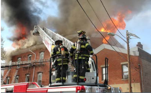
Figure 3.3.