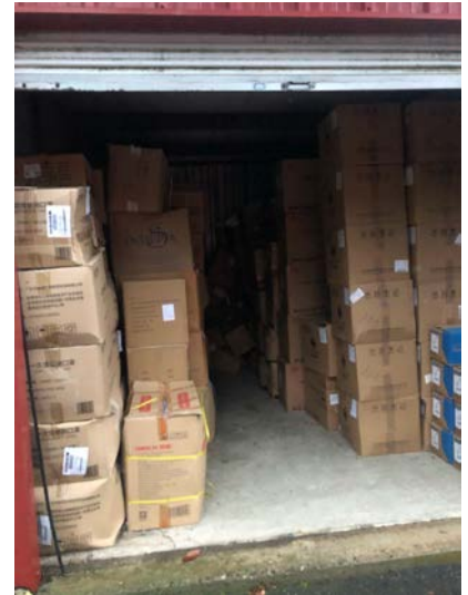
Figure 6.3.

Request SAM assistance toll free: 866-606-8220