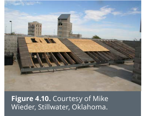
Figure 4.10.

Bonds are a way for a local government to issue debt or, in other words, raise funds. A municipal government issues bonds to support voter-approved projects and then agrees to pay back the bonds with interest. Bond funding is for assets with a long, useful life such as buildings, utility systems or vehicles ( Figure 4.10 ). The assets should have the same useful life or longer than the time it takes to repay the bond. For example, if a rescue station has a useful life of 20 years, the time it takes to repay the bond should not exceed 20 years. Bond funds cannot be used for operations, such as employee salaries. Bonds usually carry a lower interest rate than other types of funding, therefore, they are an attractive way of financing.