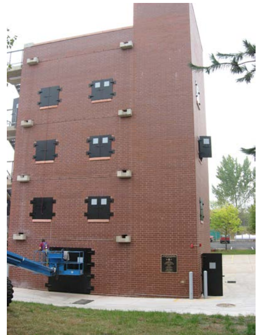
Figure 2.1.

Many public safety agencies have been successful in soliciting grants and services from national corporations. Companies are often interested in providing community assistance in cities and towns where they have a corporate presence or where their employees live. Corporate giving has public relations benefits; emergency service administrators should be ready and willing to recognize