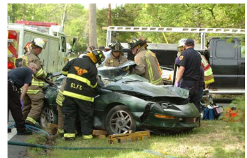
Figure 4.11.

Under an intercept agreement, when a paramedic provides ALS services on the BLS transport vehicle, the BLS service may charge ALS rates. The paramedic service provider receives the difference between the BLS and the ALS rate, and the BLS ambulance company provides its patients with a higher level of care while reducing its overhead costs. In this way, the BLS agency becomes a payer for ALS services.