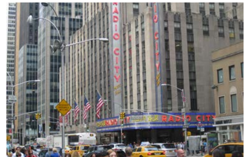
Figure 6.7.

Eligible activities: States are encouraged to apply for 15% over the high end of their target allocation range as ineffective allocations will not be funded. States are required to ensure that at least 25% of UASI-appropriated funds are dedicated to law enforcement