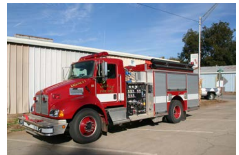
Figure 6.1.

This guide focuses on grants, but federal loan programs are also available as an alternative funding source. Loan funds go directly to the applicant, who is responsible for repayment. The main advantage of a grant is that it does not have to be paid back as long as the conditions of the grant program are met.