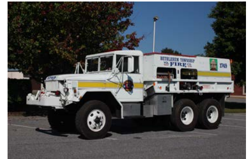
Figure 5.2.

Matching grants are a common source of funds for local agencies at the state level. While either the federal or state government may fund these programs, the dispersal of funds is generally left up to the state agency tasked with managing the grant. These grants require the department to match a portion of the grant. Depending on the grant guidance, this can be cash or in-kind contributions. Rural and volunteer organizations may receive a discounted rate on matching grants. If it is a cash contribution, the fire or EMS agency should clearly understand the grant program's requirements on when it must be supplied. Some programs require that the awardee produce its cash cost share or match at every drawdown request, which can be monthly, quarterly or semiannually. Other programs may allow it to be supplied in a lump sum at the completion of the grant. If it is a sizable award, the EMS agency needs to be prepared with cash flow.