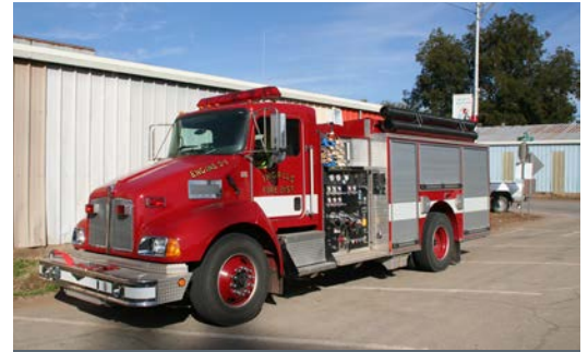
Figure 3.6.