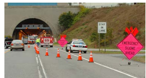
Figure 7.4.

Website: https://www.statefarm.com/about-us/corporate-responsibility/community-grants/good-neighbor-citizenship-grants