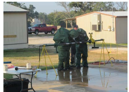
Figure 6.6.

Website: https://www.phmsa.dot.gov/grants/hazmat/supplemental-public-sector-training-spst-grant