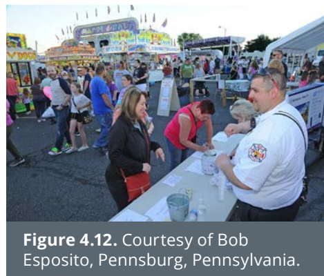
Figure 4.12.

Many fire departments held these annually in the early 1900s, and now they are on the rise again ( Figure 4.12 ). They are a lot of work but can end up being a big reward. Dunk tanks, pie-in-the-face, carnival rides, carnival games, funnel cakes, food, beverages and live music can really draw a crowd. Ensure everything requires a ticket to participate and that the fee