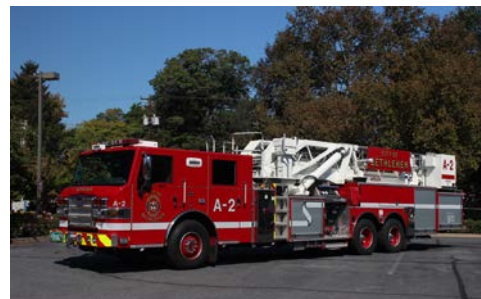
Figure 7.1.

Proposals for community foundation support should be based upon a well-defined local need. A narrowly focused project is more likely to get funded by a small foundation than a broad project whose benefits are hard to evaluate ( Figure 7.1 ).