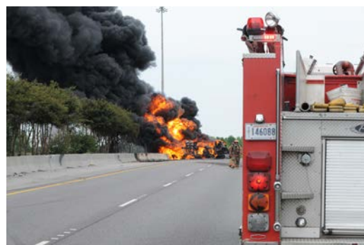
Figure 4.8.

Maintaining the capability to respond effectively to hazardous materials incidents adds significant costs for local jurisdictions. Hazardous materials response requires hundreds of hours of training and continuing education, specialized equipment and technical expertise to conduct inspections ( Figure 4.8 ). Hazardous materials occupancies do not have to be large or unusual to pose a challenge; a microchip manufacturing plant, the local pool supply store or an exterminator business can pose significant problems for first responders. Seemingly minor incidents