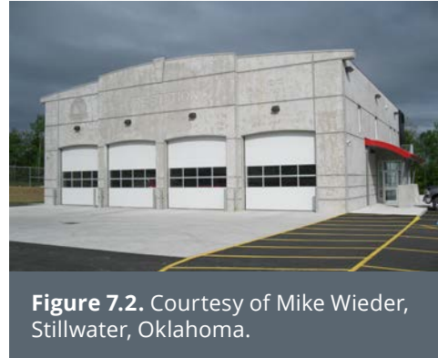
Figure 7.2.

Facility and equipment grants, sometimes referred to as capital improvement grants, provide funding for brick-and-mortar projects such as building construction or equipment purchases such as ambulances, rescue vehicles and fire apparatus ( Figure 7.2 ).