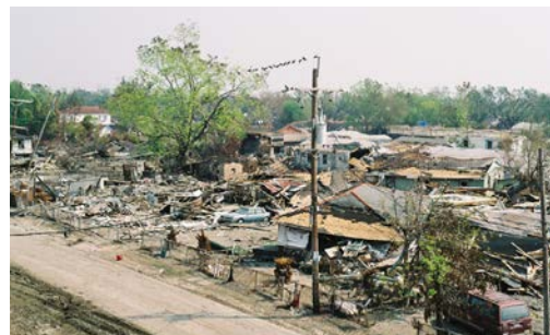
Figure 6.2.

Whether natural or man-made, local or global, disasters occur from time to time ( Figure 6.2 ). When these occur, the federal government makes an official declaration, which puts fire and EMS agencies on notice that a federal funding stream(s) will be available. Most commonly, this occurs when natural disasters such as earthquakes, snowstorms, tornadoes, hurricanes, etc., occur and FEMA's Public Assistance program is activated. Fire and EMS agencies can submit eligible expenses to their municipality related to the response, and then the municipality submits it to the administering state agency for state and federal consideration. Eligible items include labor hours, fringe benefits, donated hours/resources, equipment usage, vehicle usage, materials and supplies.