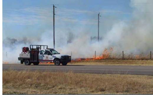
Figure 3.4.

(transportation and other) to give the grantor a picture of the jurisdiction ( Figures 3.3 and 3.4 ). Describe the constituency served, any special or unusual needs they face, and why they rely on agency programs. If the current economic or political climate negatively impacts the organization, include a mention of how it does. Cite the number of people who are reached through organizational programs.