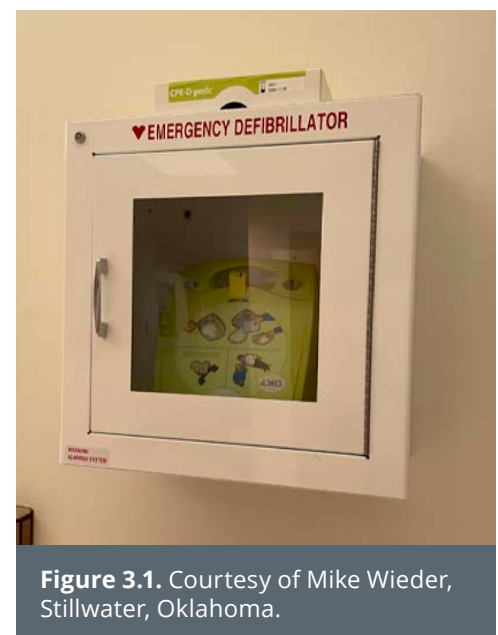
Figure 3.1.

Too often, grant seekers get caught up identifying and ranking agency needs, then searching out grants for their top priorities. Does it matter that getting a grant for an automated external defibrillator (AED) may not be at the top of the list? If a grant is available for the AED, why not apply ( Figure 3.1 )? Rather than looking for grants to fund a particular project, look at grants and see if they meet an agency need. Try to align the agency's needs with national priorities and where the money is located.