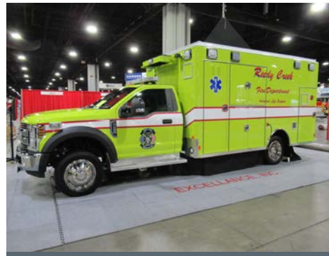
Figure 4.9.

Some EMS agencies sell services to other organizations. A principal example of this is charging fees for training to other local agencies or the private sector. These charges may just offset costs, or they can be established to provide net income. Training services are provided either as a fee-per-student or on a contract basis.