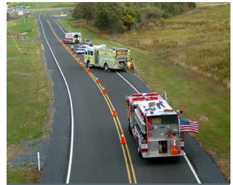
Figure 3.7.