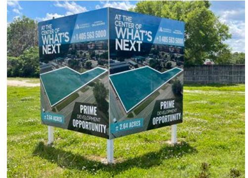
Figure 4.4.

The Western Payne County Ambulance Trust Authority covers the communities of Stillwater, Perkins and Glencoe, Oklahoma. In 2011, the authority implemented a Resident Benefit Program attaching a $5-per-month fee to residents' utility bills. The fee covers the utility account holder and all permanent members of the household should they require