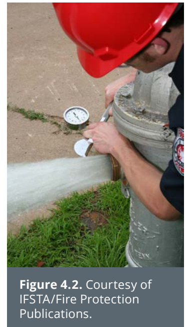
Figure 4.2.

It is not uncommon for sales taxes on some goods to be earmarked for purposes benefiting consumers of those goods. An excise tax is a type of sales tax that is applied to selective products or services. Excise taxes are typically benefits-based in that they are intended to recover at least part of a public service from those who benefit from it. In 2009, the New Mexico Legislature enacted the EMS Rescue Act that increased the Liquor Excise Tax to improve delivery of EMS, trauma, stroke and cardiovascular emergency services.