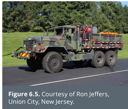
Figure 6.5.

Eligible activities: Wildfire equipment ( Figure 6.5 ).