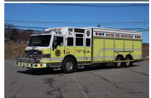
Figure 5.1b.