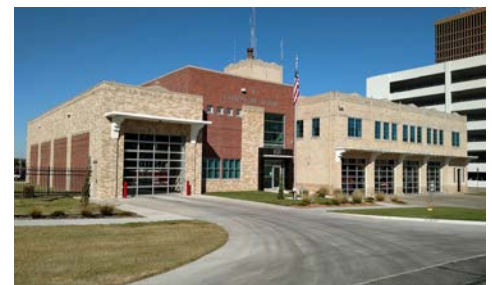
Figure 5.1a.

Some states may make funds available through low- or zero-interest loans, with favorable terms of 15 years or more, for capital improvements and purchases ( Figures 5.1a and 5.1b ). Interest rates can vary with the current status of the market at the time of application. Such programs are often set up in a revolving loan fund so that money paid back to the lender can