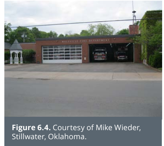
Figure 6.4.

Contact: For more information about this program, or to file an application, contact the local USDA service center in your area. Use the drop-down menu on the site listed above to locate your state.