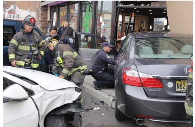
Figure 1.1.

Emergency medical services (EMS) departments and fire departments provide invaluable services in their communities ( Figure 1.1 ). In the United States, these agencies respond to millions of calls for service each year. 1 Service expectations placed on EMS and fire services organizations, including the fire service's role in EMS delivery, response to natural disasters, hazardous materials incidents, technical rescue, acts of terrorism and participation in community events, have steadily increased in number and escalated in severity.